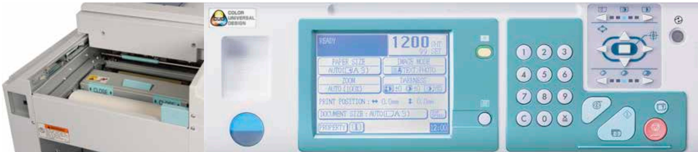
Quick replacement of master