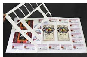
Exemples of cutting sheets.